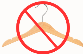
You are welcome to bring your clothing on hangers but we cannot keep them. We have plenty of hangers.

Large items that do not fit in the above containers are accepted, please let a volunteer know when you arrive. If your donation does not adhere to the above requirements, we will not be able to look through and accept your donation.