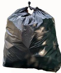
1 large black 30-35 gallon lawn bags or 2 tall 13 gallon kitchen trashbags