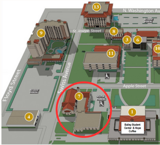
7 MITCHELL MINISTRIES CENTER DTS Bookstore Event Services Facility and Plant Operations Luke's Ministries