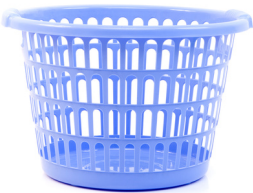
Laundry basket or plastic storage bins (2 maximum). Note: We will not be able to keep the basket or bins, they will be given back to you after we go through your donation.