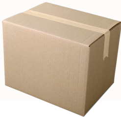
2 small/medium boxes or 1 extra large box