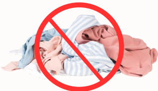
No loose items! All items must be in above approved containers.